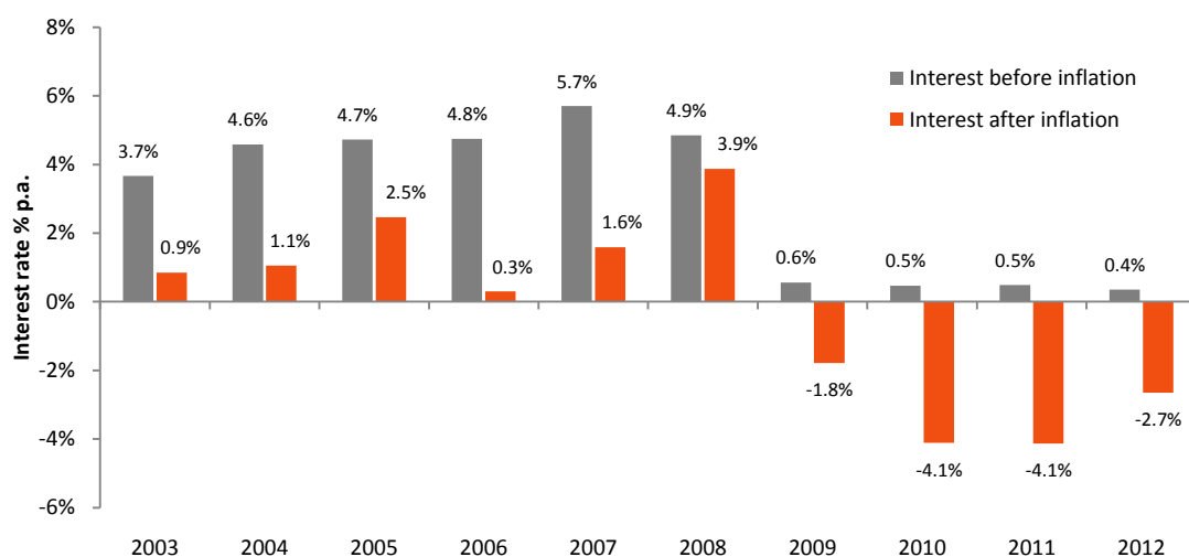
Figure 1: Holding cash is a painful place to be

Data source: UK 1-Month Treasury Bills (i.e. depositing money with the UK Government for one month)